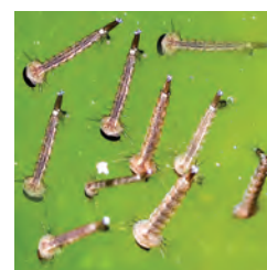
larvae seen through hand lens

Rajat: But flies don't bite. Then how do they spread diseases?